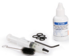
HI76981942 probe maintenance kit