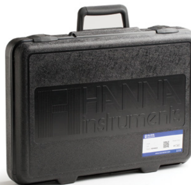
rugged carrying case with custom insert