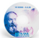
HI9298194 PC software